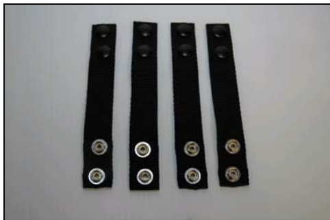
Keepers Set of 4